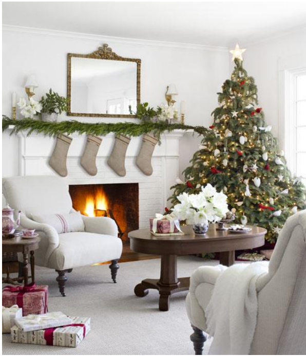
A Country Farmhouse

Here is a sample of what I think are the loveliest out of all. Its Overflowing has links to the various sites like this traditional tree from A Country Farmhouse below, if you would like to see more.