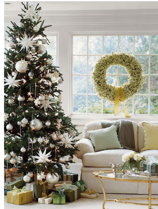
My Lovely Things

This BHG Christmas tree is covered with white and silver ornaments.