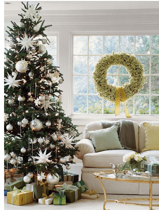
My Lovely Things

This BHG Christmas tree is covered with white and silver ornaments.